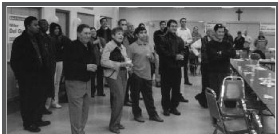
Ward 39 Volunteer gathering

If you qualified to have your property taxes frozen at 2005 levels, you must apply every year and continue to qualify each year. The deadline for the 2007 taxation year is August 31, 2007. If you are not aware of this program and would like information, my staff will be pleased to assist with details. All low income seniors are eligible to apply, regardless of whether you own a single family home, townhouse or multi-residential home.