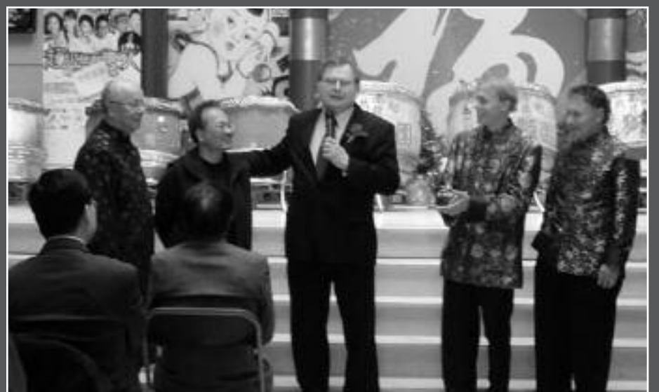
Official Opening of Splendid China Tower