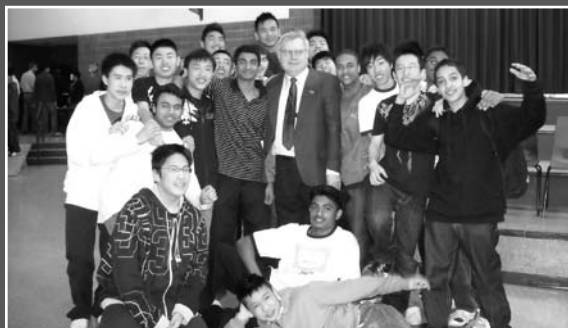
Dr. Norman Bethune CI Students at Civics Integration Day