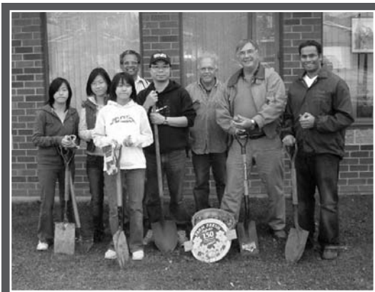
Heathwood Residents Plant Over 3000 Daffodils.

The Heathwood Ratepayers Association added to Ward 39's beauty when they planted over 3000 daffodil bulbs last fall. Congratulations to the Heathwood volunteers – you care and it shows.