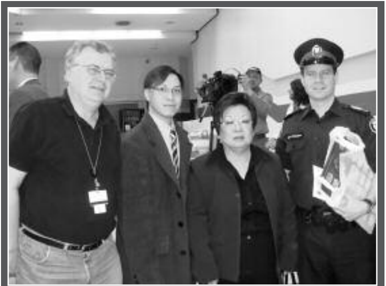
At Chief Blair's Town-Hall Meeting – L'Amoreaux CI

I am pleased to report that lines have been painted near the island to give more definition and safety to this stretch of road.