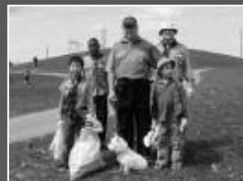
Caring for the environment with the 5th Agincourt Scout Troop