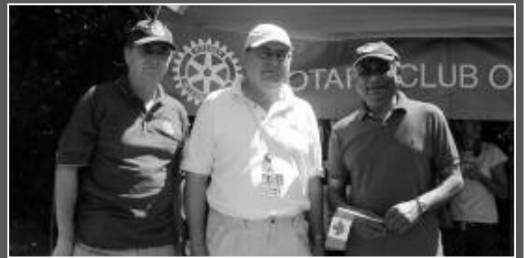
Canada Day Celebrations with the Rotary Club