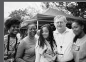
Chester Le Corner Anniversary Picnic