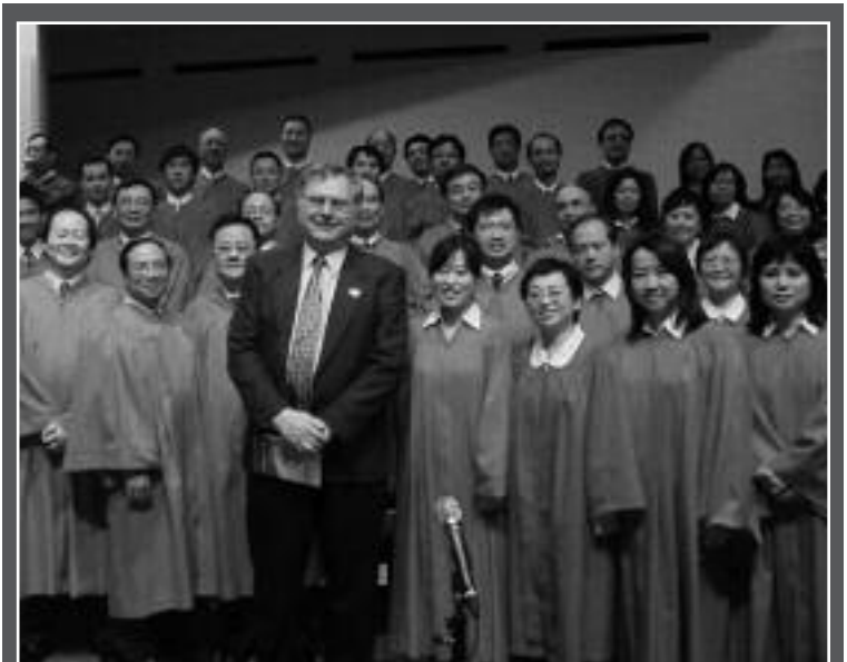
Scarborough Chinese Baptist Church Dedication

Large trucks and buses are not permitted to be parked in residential areas – the entire Ward has a "No Heavy Truck Parking Prohibition" and vehicles will be tagged and towed at owner's expense.