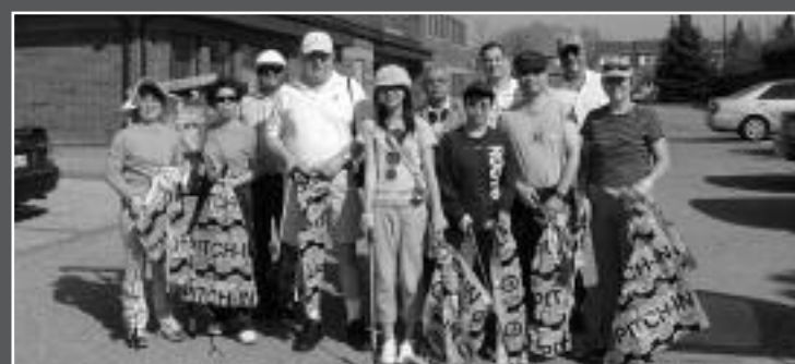
Heathwood Community Clean Up Day