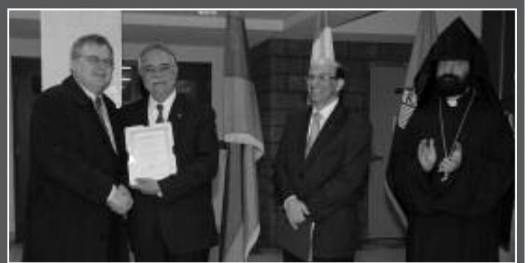
Armenian Homenetmen 50th Anniversary Celebration

Report unhygienic conditions immediately to Public Health or to this office. It is always easy to address any issue at the very onset. As your Councillor, public safety is and will continue to be a priority. I ask you to do your part to make our community medically safe and healthy...I will do my part to have the City enforce property standards to keep our neighbourhoods safe and clean.