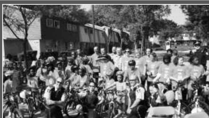
TCHC-Dutch Embassy Bike Event at Chester Le

At the end of the day I believe, that we may be going to the Ontario Municipal Board to fight the decision. OMB rulings seem to sway favourably towards developers. However, in August this year there was a precedent-setting ruling between the City of Mississauga and Queenscorp (Lakeview) Inc. where OMB turned down the application from Queenscorp (to put up a 260-unit, 21-storey tower). OMB called the proposal too excessive, calling it an "over-utilization" of the area. The development was too high, too intensive and did not provide adequate setbacks or buffers to adjacent uses. Again, Bridlewood Mall development is "NOT A DONE DEAL" .