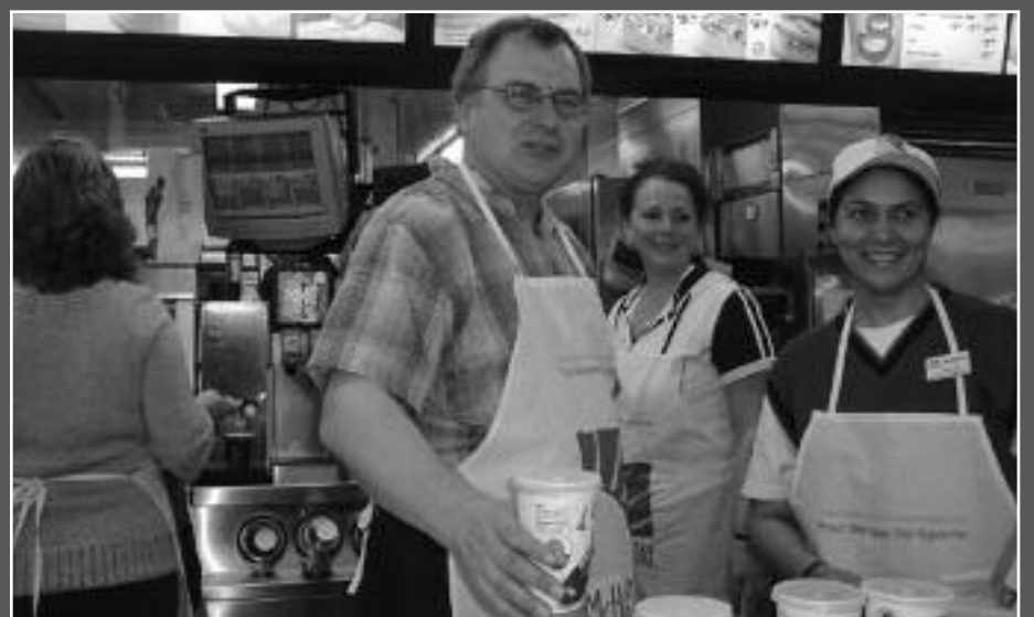
Serving you ..... on McHappy Day 2007