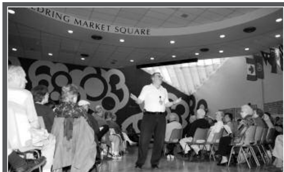
Bridlewood Mall - Town Hall Meeting - June 5, 2007