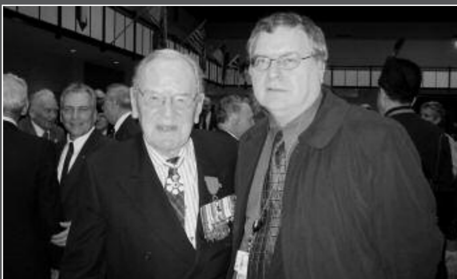
WWII - French Legion Awards