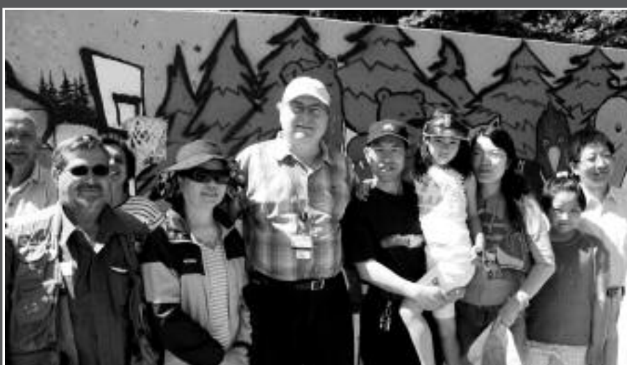
Sanwood Park Opening - June 9, 2007

The brush goes as far as the imagination. It takes skill and imagery to portray vision in beautiful art, even on concrete walls. Ward 39 is home to two exquisite mural projects initiated by “Art Starts a Neighbourhood Storefront Cultural Centre”. One is near Nicey's Food Mart Plaza at Victoria Park Avenue & Morecambe Gate, the other at 2821 Birchmount Road near the basketball court. There is another mural in Sanwood Park, designed and painted by the students of Dr. Norman Bethune CI. It is our hope to deter graffiti by producing art on walls.