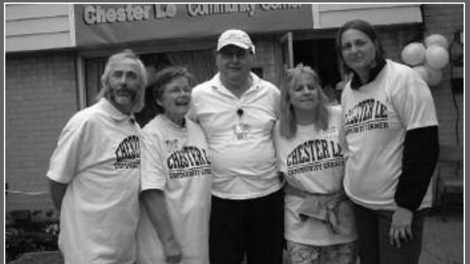
June 18, 2005 - Grand opening of the Chester Le Community Corner