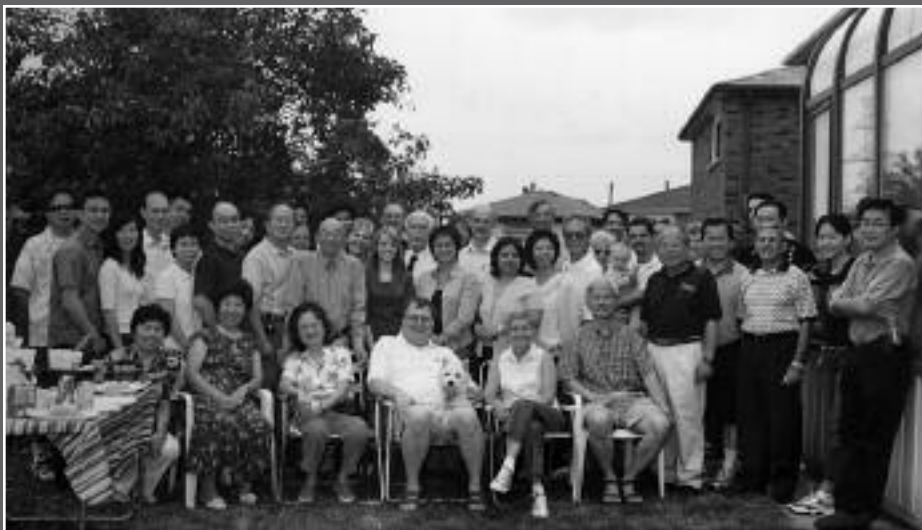
A cook-out with Community representatives

When I started this fight, I asked for your support, help and patience. You now see the fruits of our collective efforts. Thank you for your initiative. My sincere thanks also to the Drug Squad Unit for their dedication.