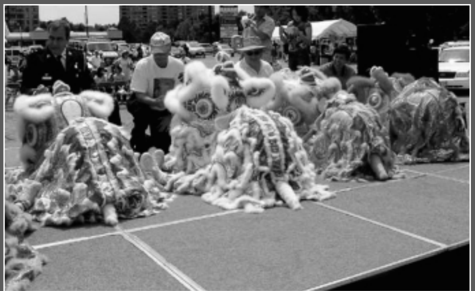
The Dotting of the Lion's Eye - Opening ceremony of Bamburgh Gardens Plaza Fund Raising Event