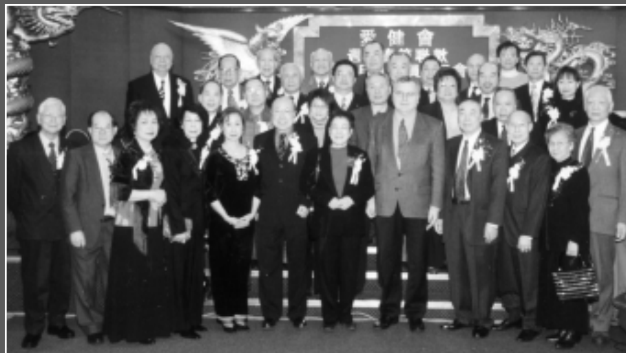
Scarborough Senior Chinese Association Spring Annual Banquet 2004 嗣萍舞蹈團2004週年匯演記者招待會

路旁泊車對第 39 選區很多居民來說是一個嚴重的問題。士嘉堡的附例容許路旁泊車最多三小時。如果您覺得路旁泊車在您的街道上構成問題，請致電泊車執法組，電話：416-808-6600，或與我的辦事處聯絡。