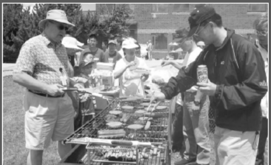
Flipping burgers at the Heathwood Community Association's Annual Picnic