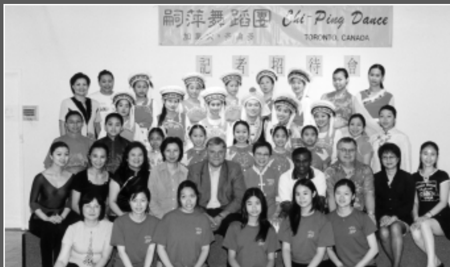
Chi-Ping Dance Group 20 th Anniversary Gala Show Press Conference 2004 嗣萍舞蹈團2004週年匯演記者招待會